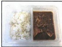
Butter Chicken & Rice $4.00