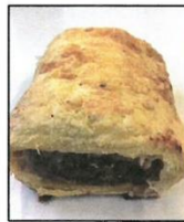
Double Happy $3.00