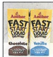
Fast Starts $2.00