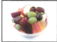
Fresh Fruit Cup $2.00