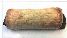
Spinach & Feta Roll $3.50