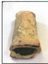
Sausage Roll $2.50