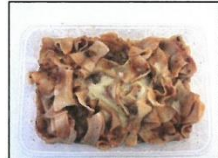
Pasta Bolognese $3.50