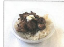
Chicken Teriyaki & Rice $2.50