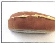
Garlic Bread $1.00