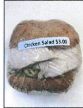
Filled Roll $3.00