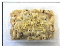
Macaroni and Cheese $3.50